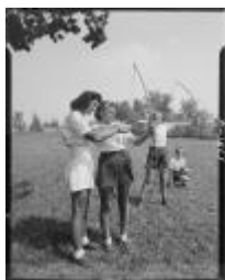
Date 8-11-1944 Girls receiving instruction in archery at Camp Woodland.

Villa St. Anthony School for Girls, grades K-6 of Nazareth Academy opened in 1942. It was located in nearby Comstock on East Michigan Avenue, about three miles east of Nazareth. That same year Camp Woodland was opened, a spiritual and recreational 4-week summer camp for young girls ages 5-15. Villa St. Anthony School closed in 1956. Camp Woodland closed in 1962.