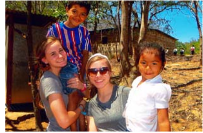
Shrine Catholic High School Nicaragua Trip