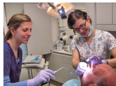
One of volunteer dentists with an assistant working with a denture patient.