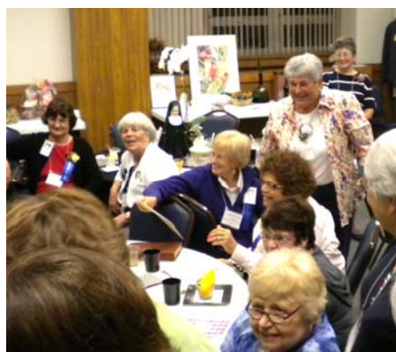
Everyone had fun at the After Glow and Silent Auction!